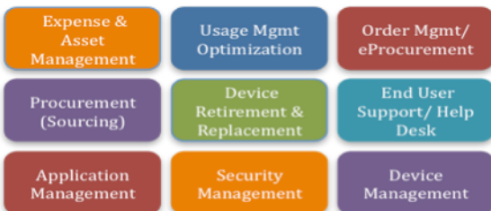
Full wireless lifecycle management

Take control of wireless with Asentinel's WEM solution set. Wireless invoices are landmines of extra charges and hidden fees that can be easily spotted and disputed with Asentinel 6.0. The application also provides visibility of current usage and spending, giving you the Business Intelligence to optimize plans and renegotiate rates. Our managed and professional services team can streamline all of your wireless processes from initial provisioning to end-of-life retirement. Services include eProcurement, help desk, BES support, optimization, policy management and fulfillment / kitting.