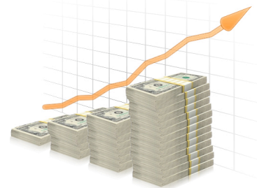
Unlock significant savings with one-time professional services

From historical audits to contract negotiations, our one-time professional services can kickoff your TEM program or be an add-on geared to identify further efficiencies after implementation. Asentinel provides the following á la carte options to accelerate optimization of their telecom programs: benchmarking, contract negotiation, historical audit, inventory build / validation, network optimization, service optimization and staff augmentation.